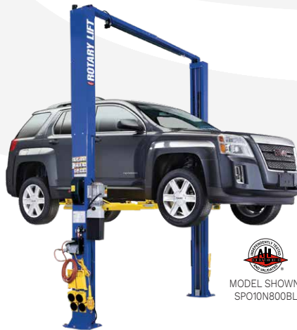
MODEL SHOWN: SPO10N800BL