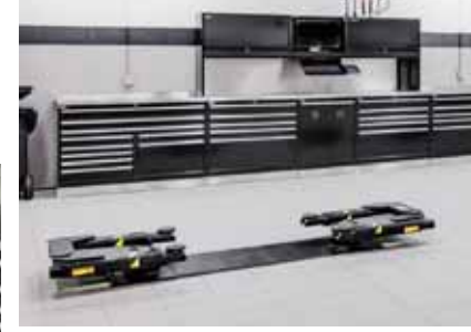
Shown: Work bench with center bench controls