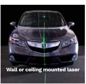
Spotline™spotting laser helps spot vehicles the first time.