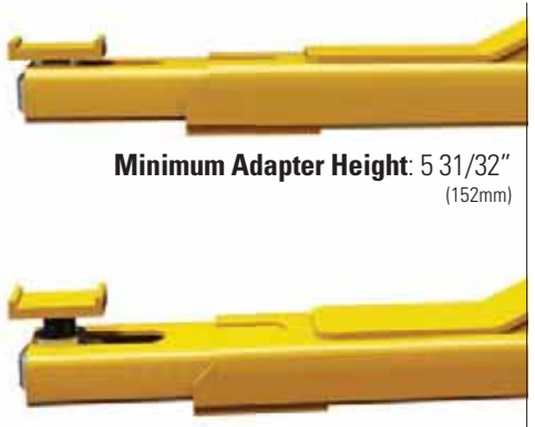
Maximum Adapter Height: 8 1/32" (203mm)

and 5" (4 each) stackable adapter extensions.