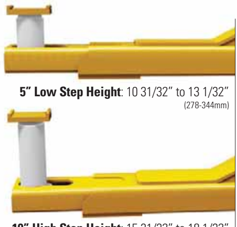
10" High Step Height : 15 31/32" to 18 1/32" (406-470mm)